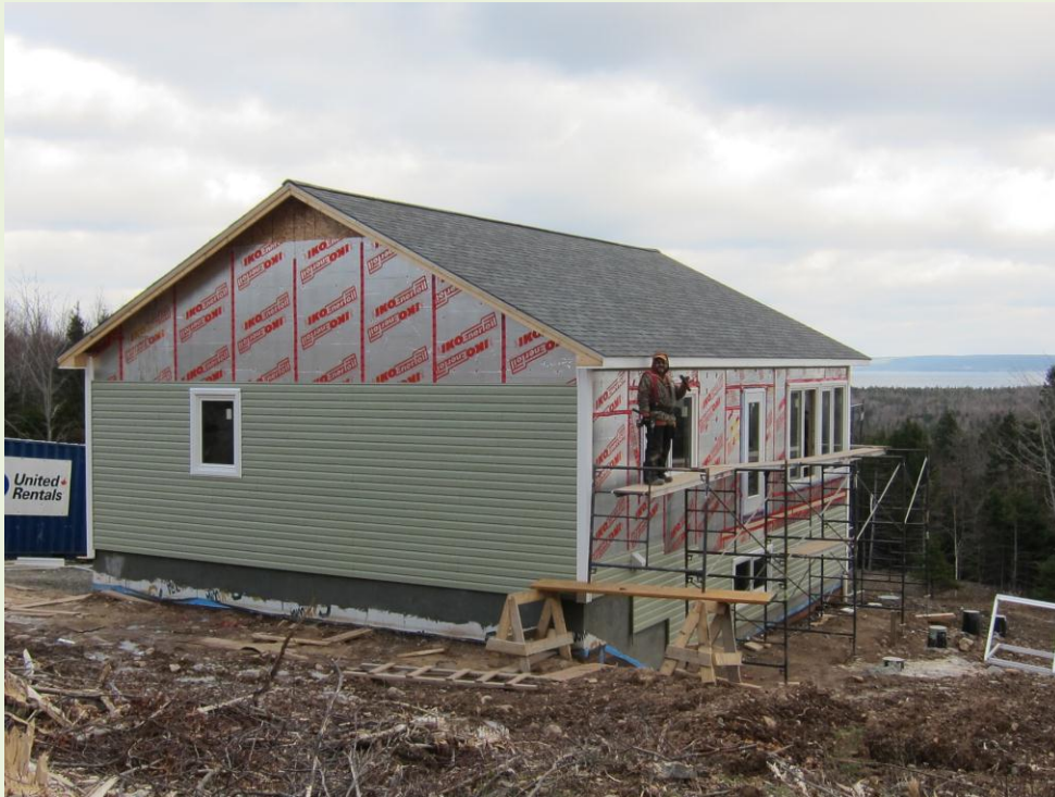
The new home harvests the energy from the sun