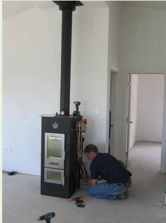
The Waltherm during installation and installed.